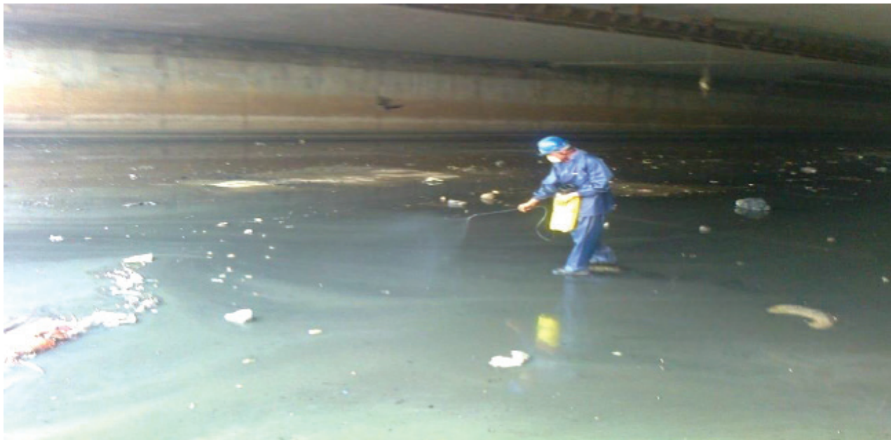
Figure 4. Paste Control for Insect Issue

(4) Continuous light arrangement provision was necessary.