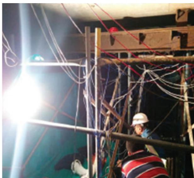
Figure 5. Wiring of Sensors near Data Acquiring Arrangement in Congested Site Area