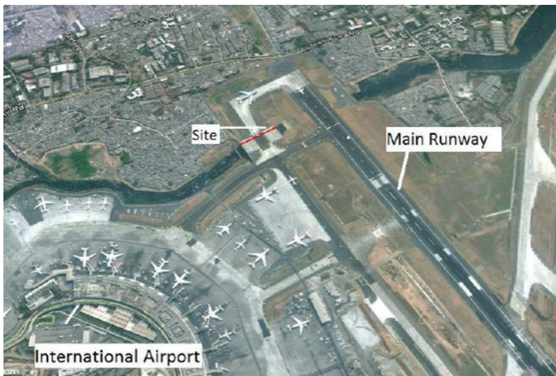
Figure 2. Position of Mithi River Bridge below the Runway

The bridge under consideration is the one at the Mumbai Airport, over the Mithi River. The bridge structure is a reinforced concrete structure, earlier designed for smaller aircrafts. But the bridge won't be sufficient to carry the loads of the current design of aircrafts (Fig. 2). Hence a need for strengthening the bridge arose and considering all the available techniques, FRP laminate bonding was suggested. This was in view with the overall repair costs and anti-corrosion properties of the FRP materials. The structural health monitoring has also carried out before and after the retrofitting work. Different troublesome site challenges were faced during both monitoring and retrofitting work.